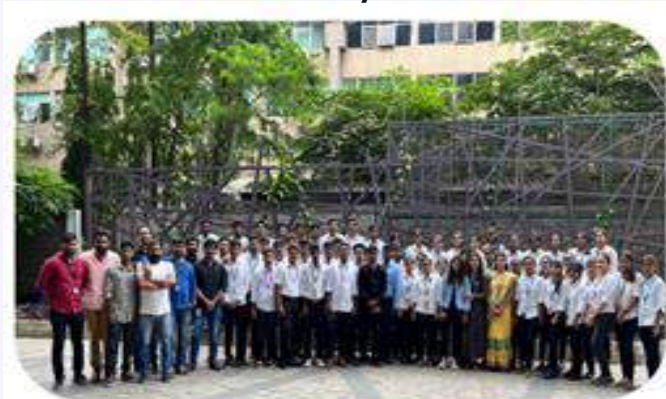
Industry Visit 2022