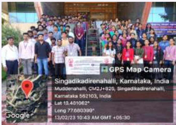
Industrial Visit - ATAL IDEA Lab @ VTU Muddenahalli